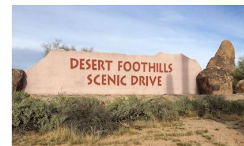
Scenic Drive Monument, Exhibit Area,

The South location is most convenient for residents who live north of Pinnacle Peak Road and south of Dixileta Drive, e.g., Monte de Paz,