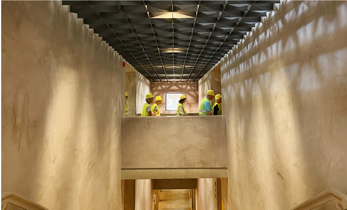
Hard Hat Tours at ASU Art Museum.