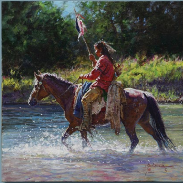
Show Art: Martin Grelle, Signs of Success , 2020, 12X12 Acrylic on Linen