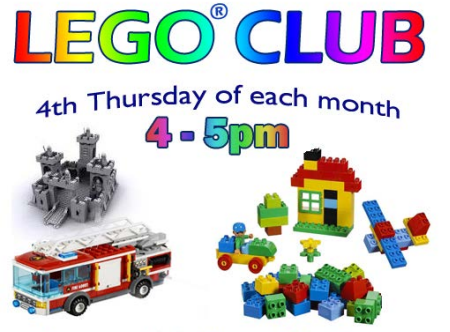
Have some fun building with Miss Karen. Legos & Duplo blocks for ages 4 & up