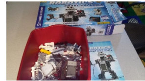
Fun Building supplies!

This program is supported by the Arizona State Library, Archives & Public Records, a division of the Secretary of State, with federal funds from the Institute of Museum and Library Services.