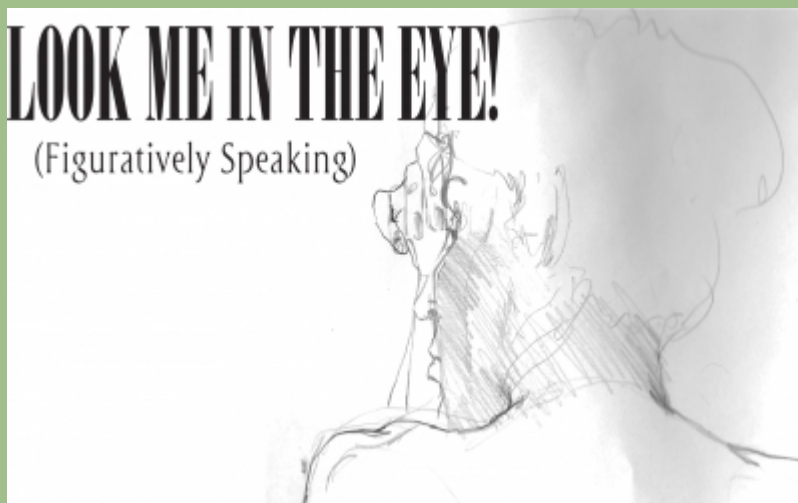
EXHIBIT WITH 17 LOCAL ARTISTS