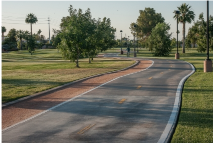
Camelback Park in Scottsdale