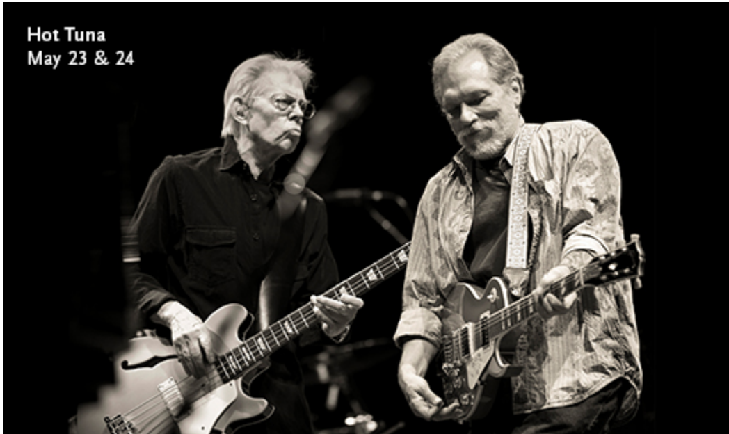
Hot Tuna May 23 & 24