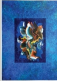
Dennis Kleidon Ethereal Essence II

Holland Gallery of Fine Art | December 16-21, January 3 - 27, 9:00 AM - 4:00 AM 34250 N. 60th Street, Building B, Scottsdale, Arizona 85266 | Opening Reception: January 14, 4:30 - 6:30 PM