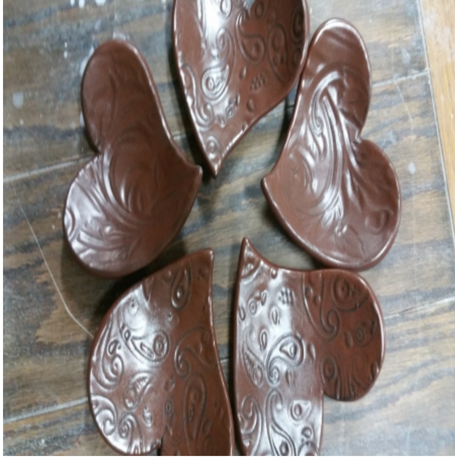
Ceramic Hearts - Casey Cheuvront