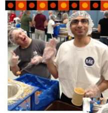
Check out these smiling faces! #STARSmiles