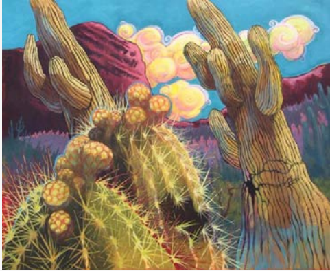
2017 1st place winner by Genise McGregor.

It's Art for Land's Sake - A juried exhibit and sale Entry deadline: Monday, February 19 No later than 4:00 pm