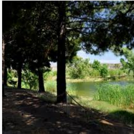
Black Canyon Heritage Park

This event offers participants of all ages and physical abilities a variety of discovery experiences to instill respect, responsibility, and stewardship for the outstanding cultural, historical, recreational, and environmental offerings in Black Canyon City and the areas that surround it. Come check out the food, crafts, informational booths, and activities that will appeal to people of all backgrounds and ages. A perfect day trip for outdoor enthusiasts!