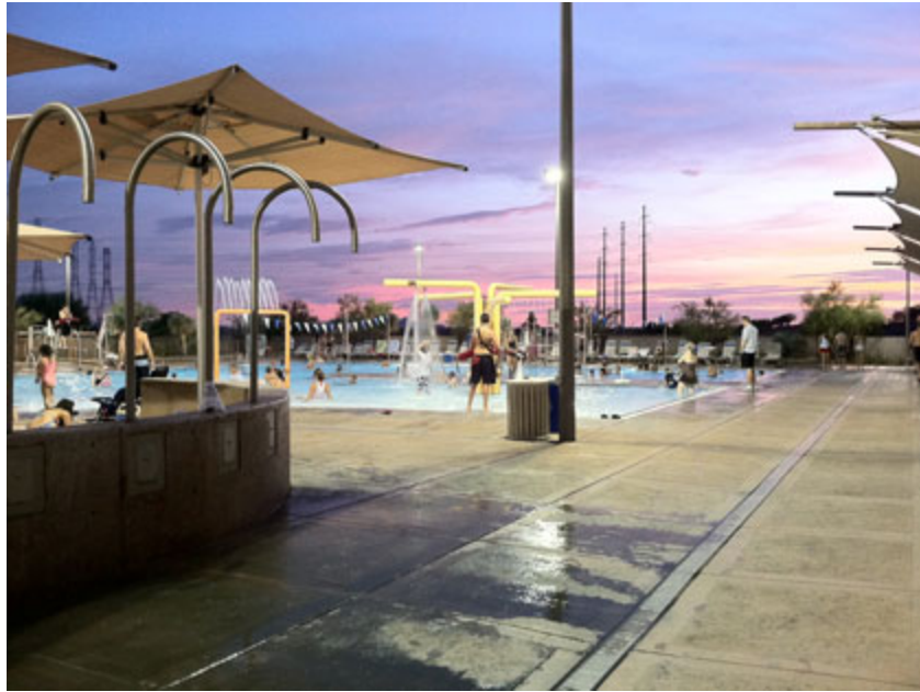
McDowell Mountain Ranch Pool