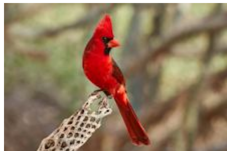
Northern Cardinal