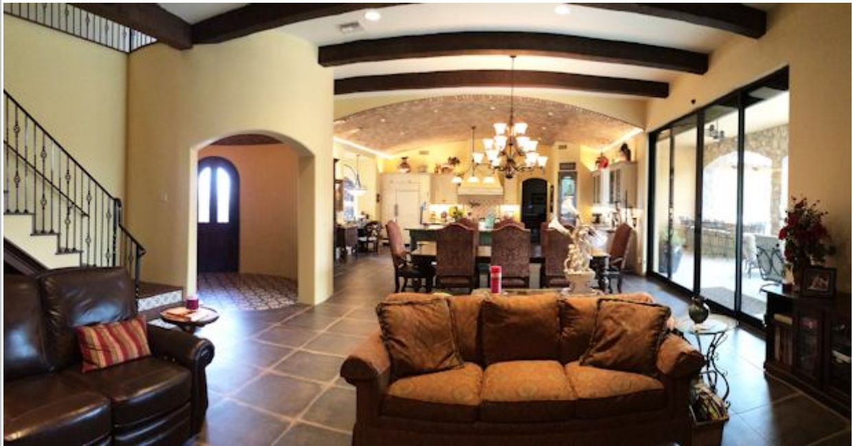
Cave Creek Museum Home and Garden Tour is March 12th