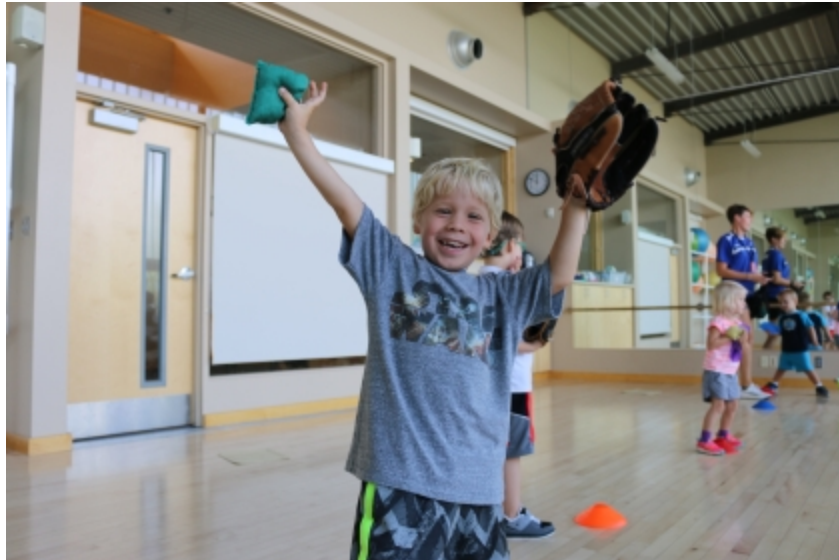
Indoor Multi Sport Class for Kids